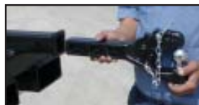
ADAPTER with COMBO HITCH Model 1393

Max. Vertical Lift – 600 lbs. Max. Gross Towing Weight – 6,000 lbs. Horizontal Center of Gravity – 28" Weight with 2" Ball – 230 lbs.