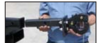
ADAPTER with PINTLE HITCH Model 1392

Max. Vertical Lift – 2,000 lbs. Max. Gross Towing Weight – 10,000 lbs. Horizontal Center of Gravity – 30" Weight with Combo Hitch - 240 lbs.