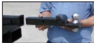
ADAPTER with 2" BALL Model 1391

Max. Vertical Lift – 600 lbs. Max. Gross Towing Weight – 6,000 lbs. Horizontal Center of Gravity – 28" Weight with 2" Ball – 230 lbs.